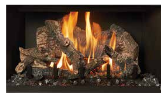
Classic Oak 10 Piece high definition log set