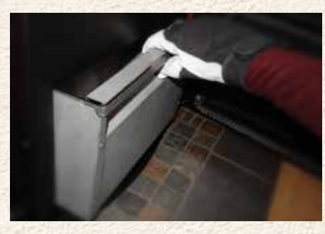
Less maintenance with an extra-large ash pan.

Quickly observe fuel levels through the tinted hopper lid, or let the Harman EASY Touch Control automatically remind you when fuel is low.