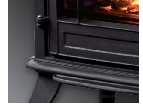
Cast iron doors