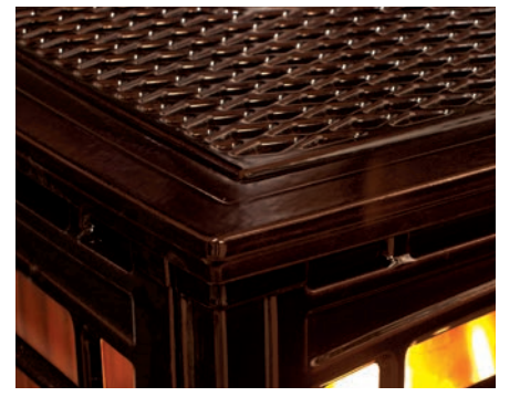
European castings - enameled antique chestnut