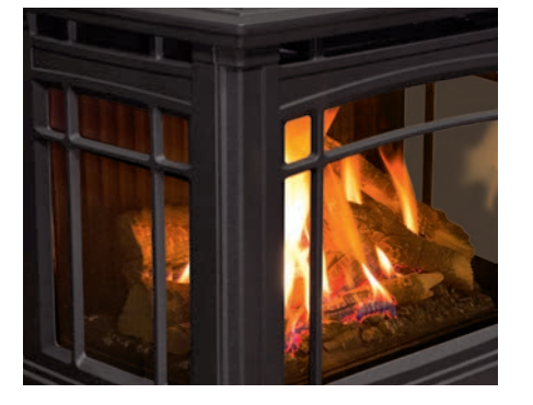
Flame visible from three sides