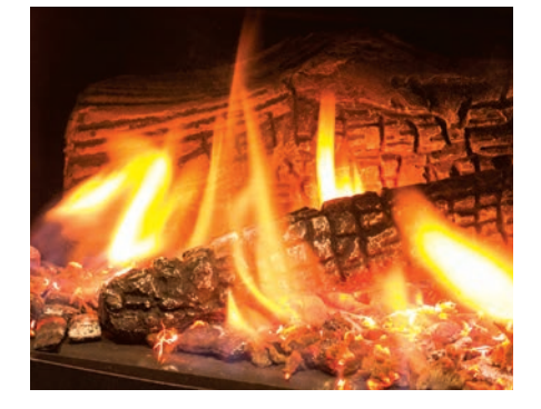
High definition log set