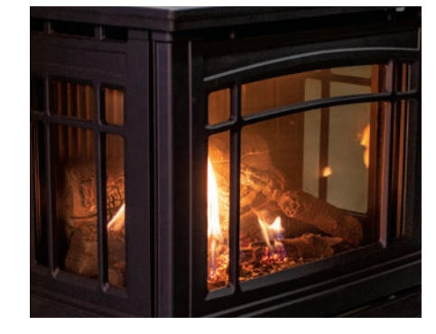
Flame visible from three sides