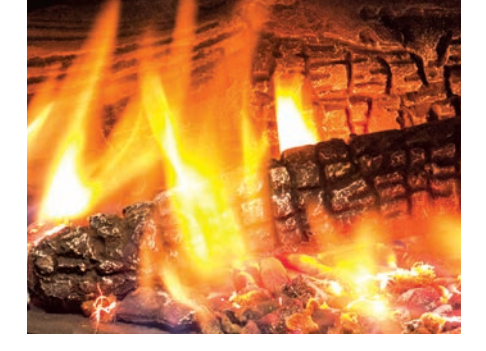
High definition log set