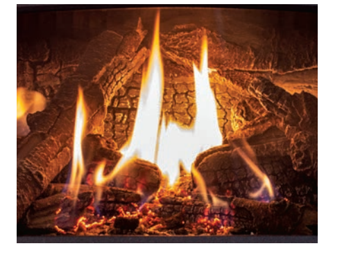
8 Piece ultra high definition log set