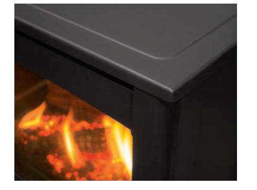
Formed steel outer construction