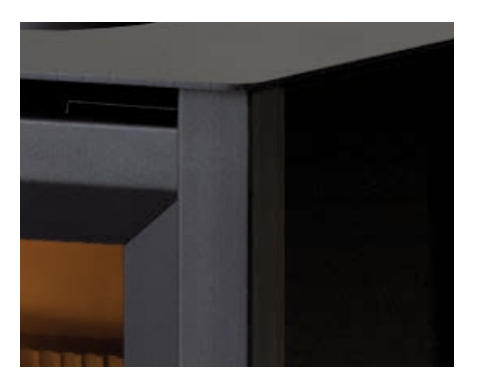
Modern steel construction