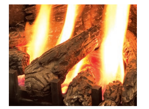
High definition log set