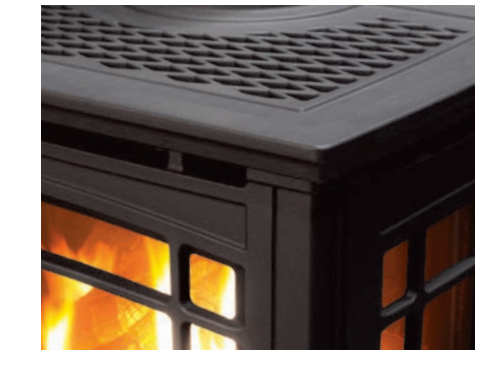
European castings - Painted Black