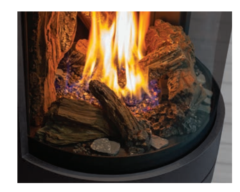
Modern Curved Design