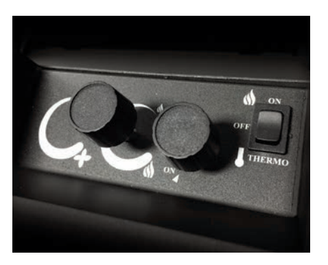
Easy access controls